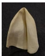
Panama Hat (Lower drawer, LH display cabinet)