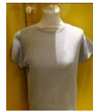
Cliff Richard Tee shirt (RH display cabinet)

Most young people may not realise how familiar they once were. In 1953 there were 685 police boxes on the streets of London.