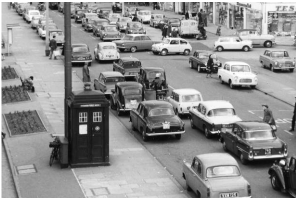
Police Box in Shenley Rd c1960

Police boxes predate the era of mobile telecommunications and now British police officers carry two-way radios or mobile phones rather than relying on fixed kiosks. They were therefore phased out and removed around 1970.