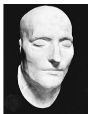
Napoleon death mask (RH display cabinet)

(A closer look at the history of 4 museum exhibits)