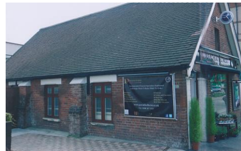
The 'Gem' Cinema

Further along Station Road, our group reached 'The florist with a chequered past', originally built as a Baptist Chapel in 1894, it became the 'Gem' cinema in 1914, where local people could watch themselves as 'extras' in silent films made in their village. In the 1930s the local council used the building as offices and finally it became a Public Convenience before the present florist business took over.