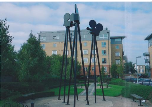
Site of 'The Gate Studios'

We went through the 21st century housing estates to Station Road and the site of Whitehall Studios built in 1928, this became a sound studio in 1929.