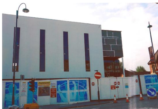
96 Shenley Road, September 2013

We are due to move there in late October 2013. The building will then be known as '96 Shenley Road' - the '96' in very large numerals will be on the front of the building.