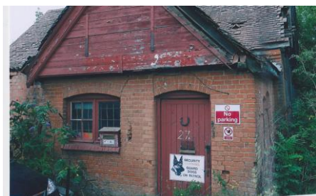
The first School has seen better days

The first National school in Boreham Wood opened in 1896 is now in a very dilapidated condition. It is off the road near the Boreham Wood Working Men's Club.