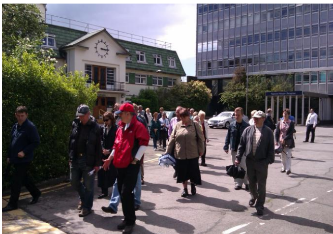
Inside BBC Studios with Fairbanks Offices on the left and Neptune House to the right

The highlight of this particular walk was a tour through part of the BBC Studio's, which started off life as Neptune Studios in 1914, with a photo opportunity outside the original 1930's Fairbanks Offices occupied by Douglas Fairbanks in the 1950's. We continued our walk across Meadow Park and on towards what was once Bullbaiters Farm near the top of Bullhead Road, this marked the highest part of the route.