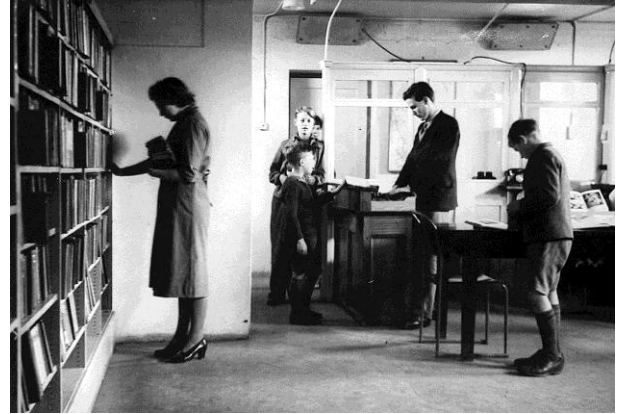
Clarendon Road Library in 1946

Membership increased and when the lease ran out in 1947 the library moved to Clarendon Park, Clarendon Road in an existing building also used as a first aid post and welfare centre