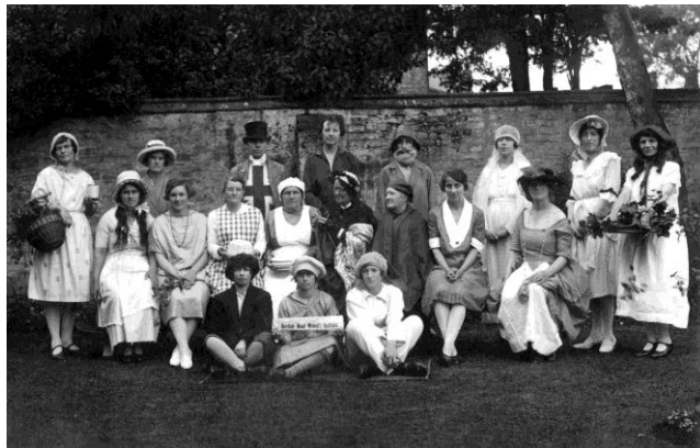
Founding members of the Borehamwood Women's Institute in 1923

The Year's programme was prepared including a Trip to the Wembley Exhibition and help was given to the Elstree Flower Show assisting Aldenham WI with the Clockwork Golf Competition. Other notable events of the year was the purchasing of Crockery and the recovering of hats (an essential item of women's clothing at the time). First Aid Instruction to help care for the sick was given by a nurse, as Doctors visits were very expensive.