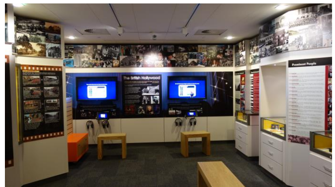
The new Museum Interior

Glass fronted units and drawers house items of historical interest and these displays can be changed on a regular basis to provide alternative presentations.