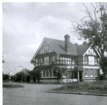
New Lord Nelson circa 1934

Nelson Cottage, Well End, is a two storey two bay timber framed house dating from c1600. It became a beer house in 1841, was bought by Hertford Brewers McMullen's in 1912 and was known as the Lord Nelson. It closed in 1932 and the building reverted back to a dwelling house, McMullen's building the new Lord Nelson on an adjacent plot of land.