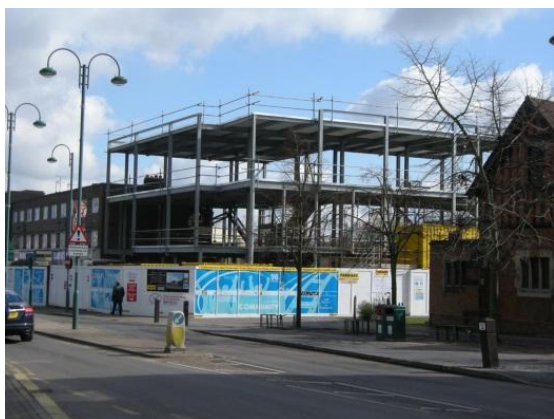
Under construction March 2013

The Elstree and Boreham Wood new museum development is moving ahead at speed. As fast as the steel framework goes up at 96, Shenley Road, things are also gathering pace at the current museum location of 1, Drayton Road.