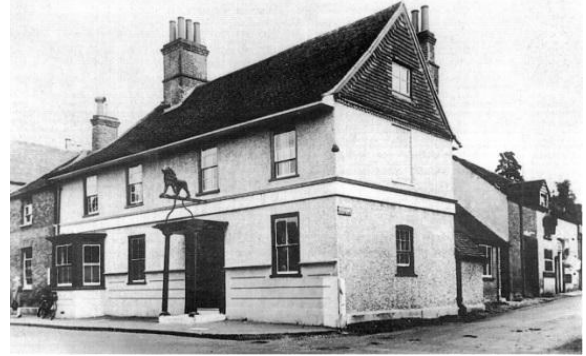
Red Lion circa 1900

He died in 1885, and the Red Lion was demolished in 1934 to make way for improvements to the dangerous corner at the junction of the High Street and Barnet Lane.