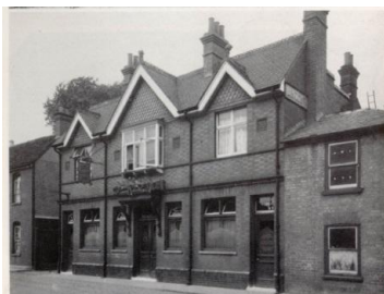
The Wellington circa 1903

The Wellington , in Theobald Street, dates from at least 1851 when it was known as the Jolly Steamer. It was renamed The Wellington by 1890 and the present pub dates from 1908.