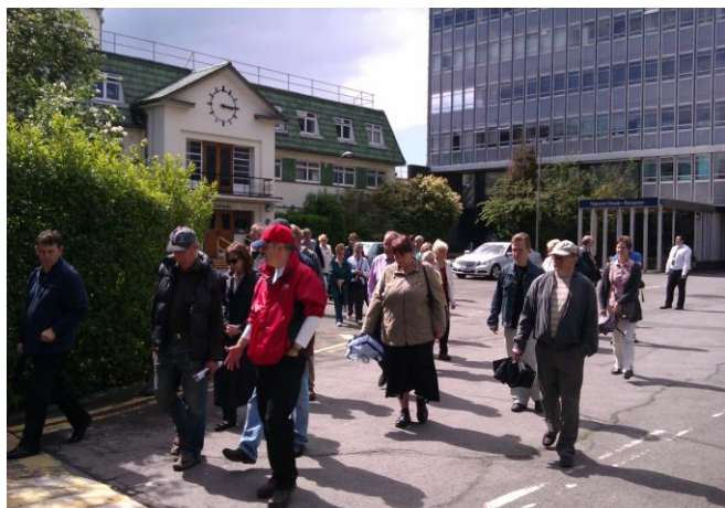
Inside BBC Studios with Fairbanks Offices on the left and Neptune House to the right

The highlight of this particular walk was a tour through part of the BBC Studio's, which started off life as Neptune Studios in 1914, with a photo opportunity outside the original 1930's Fairbanks Offices occupied by Douglas Fairbanks in the 1950's. We continued our walk across Meadow Park and on towards what was once Bullbaiters Farm near the top of Bullhead Road, this marked the highest part of the route.