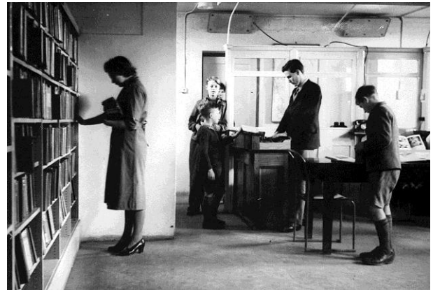
Clarendon Road Library in 1946

Membership increased and when the lease ran out in 1947 the library moved to Clarendon Park, Clarendon Road in an existing building also used as a first aid post and welfare centre