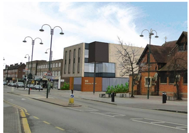
Artist impression of new building at 96 Shenley Road

Officer to prepare for moving to this new site. The museum space will be a 'blank canvas' and it will be up to the museum to take this once in a lifetime opportunity to create a dynamic and accessible museum where our local community will enjoy and get involved in their heritage.